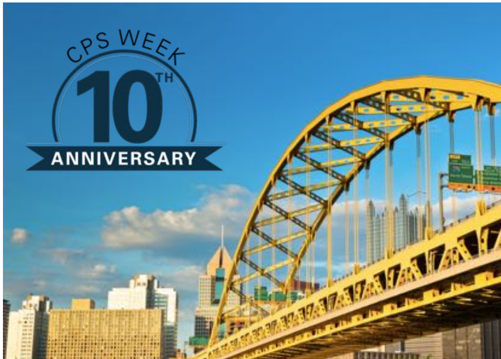
THE CPS WEEK GUIDE TO PITTSBURGH